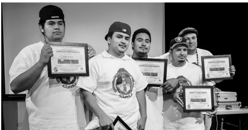
CURYJ Young Men’s Circle awarded recognition for their involvement in “Forgotten Voices,” a participatory action-based research project with CURYJ completed in 2014. The photo-novela used the PhotoVoice method to evaluate assets and challenges the young men experienced in their community. More info at: http://pacinst.org/publication/foto-novela/

– Debra Mendoza, Former Probation Officer