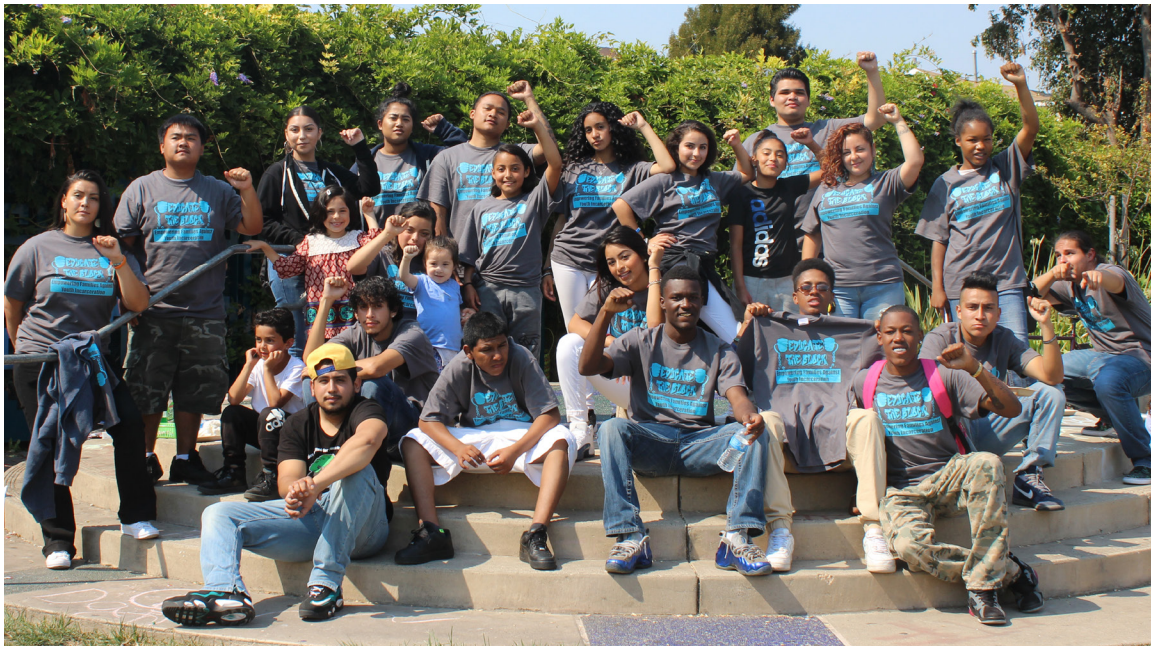
Homies 4 Justice interns at the Educate the Block Party to Pass Prop 57. Youth across California organized a series of actions to ensure voters knew how Proposition 57 would help youth: by ending the direct file of youth into the adult system. Homies 4 Justice held a day-long block party in the Fruitvale neighborhood of Oakland to mobilize voters of color, women, and low-income voters who are often marginalized in elections, but are most directly impacted by policies. Proposition 57 passed in November 2016.

– Phillip, charged as an adult at age 16