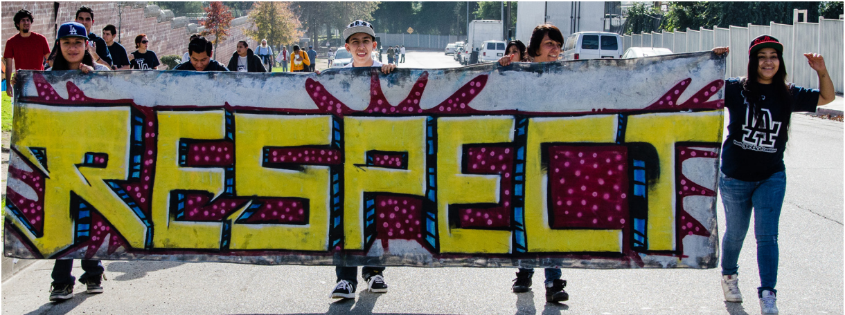
Youth Justice Coalition members rally outside Barry J. Nidorf Juvenile Hall in Los Angeles County — the largest juvenile hall in the world that includes a 250 cell “compound” for the detention of youth who have been transferred into adult court. The compound looks and operates like a baby supermax prison with single-person locked cells, high security fencing with razor wire, and probation officers in military-style uniforms.

An Advisory Committee contributed to the project scope, advised on data and research sources, connected the authors to focus group participants and interviewees, reviewed the draft findings and report, prioritized recommendations, and advised on communications activities. See Appendix B for a detailed description of the HIA process and methods. Advisory Committee members are listed above in the Acknowledgements section.