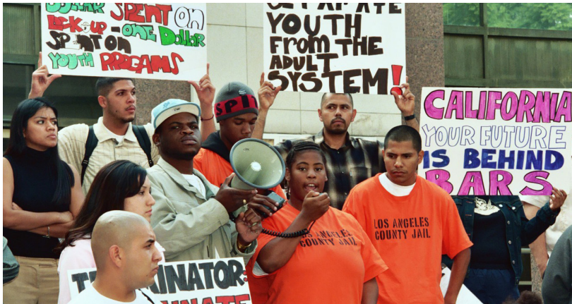
In its first year in 2003, the Youth Justice Coalition marched 50 miles across LA County stopping at each of the county's juvenile halls, ending at the California Youth Authority youth prison in Norwalk. The "March for Respect" called for a repeal of Proposition 21 and an end to the transfer of youth into adult court.

These “tough on crime” laws were fueled by high-profile criminal cases involving youth, sensationalized coverage of juvenile delinquency by the media, and crusading politicians who warned that juvenile “super-predators” posed a significant threat to public safety. 21-23 The general sentiment across the political spectrum was that treatment approaches and rehabilitation attempts did not work.