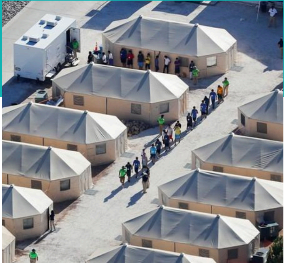
Tornillo, photo courtesy of Reuters