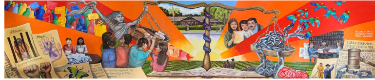
U.C. Davis Immigration Law Clinic